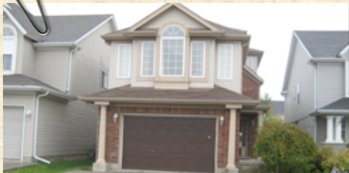
59 Porter Drive

REC / GAMES ROOM 15' 6" X 11' 11" Fully above ground, walk-out to back yard, extra windows, L-shaped, built-in shelving unit with lighting; extras: lots of storage space, laundry/utility room